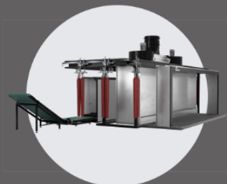
SPRAY CONVEYOR CAB. 4 16 DUMMIES